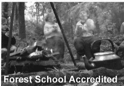
Forest School Accredited